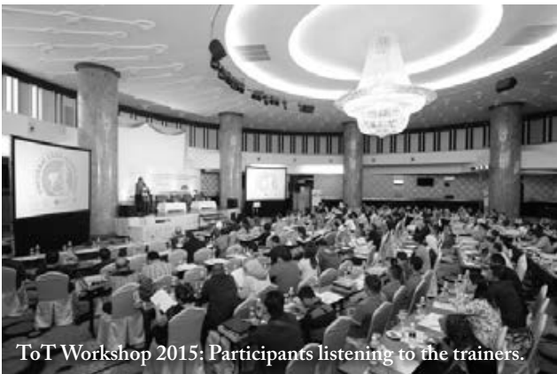
ToT Workshop 2015: Participants listening to the trainers.

Level 3 nutrition modules will be taught to teachers via a workshop on 23rd & 24th July 2016 to ensure that the teachers understand the entire module and deliver the nutrition knowledge effectively to their students. Teachers will then implement the modules until end of 2016. Analysis will be conducted in 2017 to determine the effectiveness of the modules.