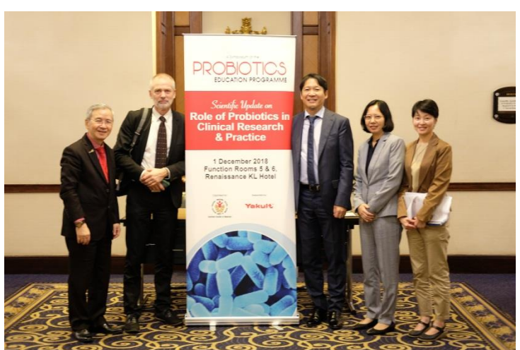
Chair, speakers & guests