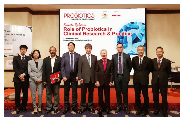
Chair, speakers & guests